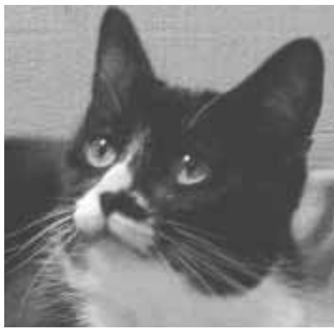
Kaz needs a home. Can you give him one?

One response to the problem has been trap, neuter and release (TNR) programs, the costs borne largely by animal rescue and welfare groups, as well as by concerned citizens. However, the number of cats dealt with under TNR programs is estimated to be only five per cent of the feral cat population.