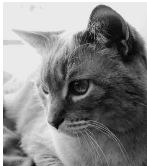
Daisy: The fastest three-legged cat you ever saw.

Now, as always, he's just the best dog in the world.