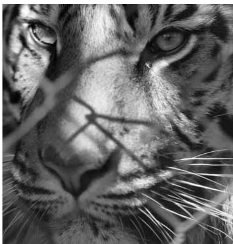
Tigers were to be chained at a party in Whistler.

VHS initiated a telephone and email protest and issued a news release condemning the performance, which triggered intense media interest and coverage. The protest grew and the restaurant was del-