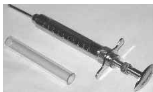
Baby mice are placed in this syringe and fed to reptiles.

repugnant business of supplying "feeder" animals to reptile owners. With shocking callousness, the