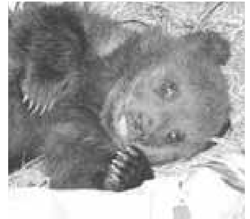
Koda is one of two orphaned grizzly bear cubs that animal protection groups hope the BC government will allow to be rehabilitated back to the wild.

Despite evidence from bear rehabilitation experts supporting the idea, the provincial government will not (to date) allow the bears to be transferred to the facility. If they are not rehabilitated to live in the wild, the bears will live the rest of their lives in captivity.