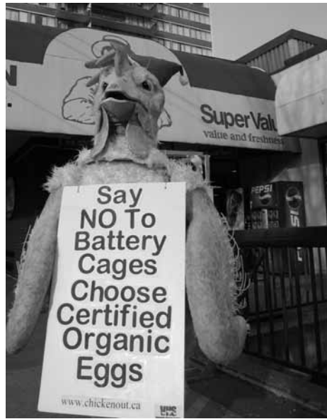
Henny gave a lump of coal to Super Valu at Christmas to highlight parent company Loblaw's failure to label its eggs from caged hens.

Henny, our battery hen mascot, appeared at Loblaw-owned grocery retailers Super Valu and Superstore to encourage Loblaw to label eggs that are not from caged hens. Henny's appearances are drawing attention to VHS's ongoing Chicken Out! campaign. For more information, visit www.chickenout.ca